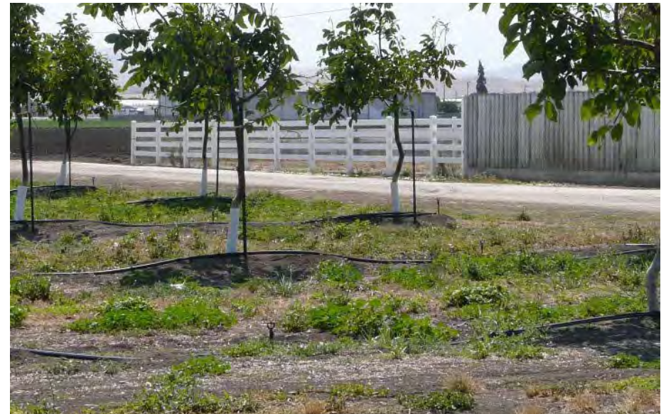
Views into the property and along San Felipe Road.