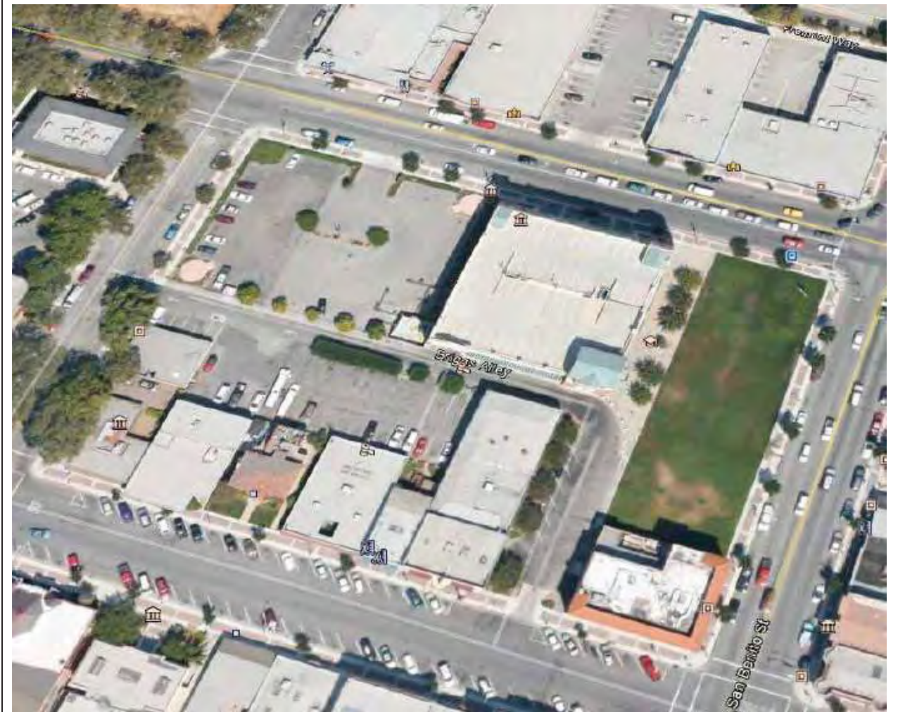
Figure 7 Successor Agency Properties on 400 Block “Grassy Lot”