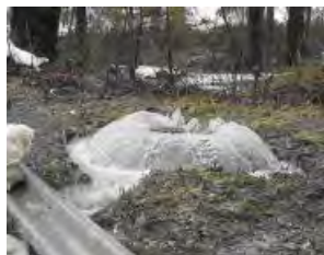
Sewer Manhole Overflow

The City of Hollister Utilities quickly responds to and resolves these backups and overflows. However, prevention is the best and wisest solution to this growing problem.