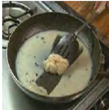
Both liquid oils and solid fats should be placed in absorbent containers prior to trashing.

What happens when you fry bacon, broil hamburgers or bake meat? When you're finished, what remains in your cooking pan? The answer is FOG – a real enemy of our sewer system – a substance that, when poured down your drain or into your garbage disposal, will build up over time, constrict the flow of wastewater and eventually cause sewers to back up into homes, overflow sewage into streams, rivers and the Bay.